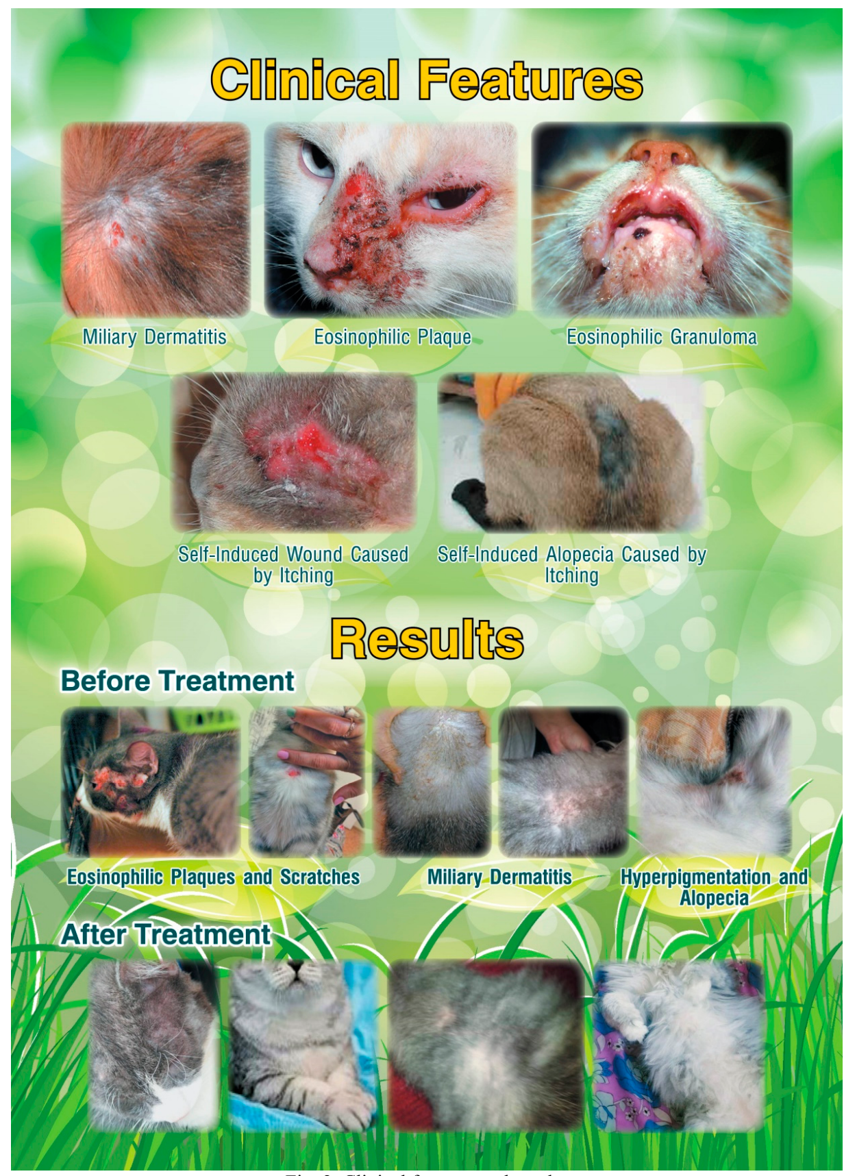
Fig. 2. Clinical features and results

The data obtained make it possible to state that the influence and nature of the therapeutic action of complex LLLT in cats with hypersensitivity to flea bites are reflected in the positive dynamics of the clinical picture of the disease, morphological composition of blood, regenerative function of the skin, serum IgE concentration decrease.